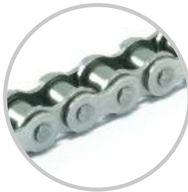
Stainless Steel Chain