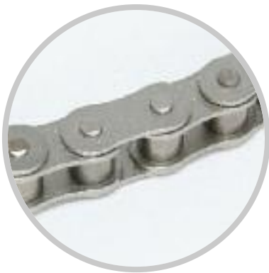
Nickel Plated Chain